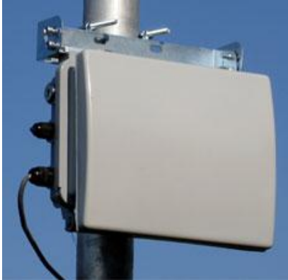
Cu200 and Cu500 Optional Configurations